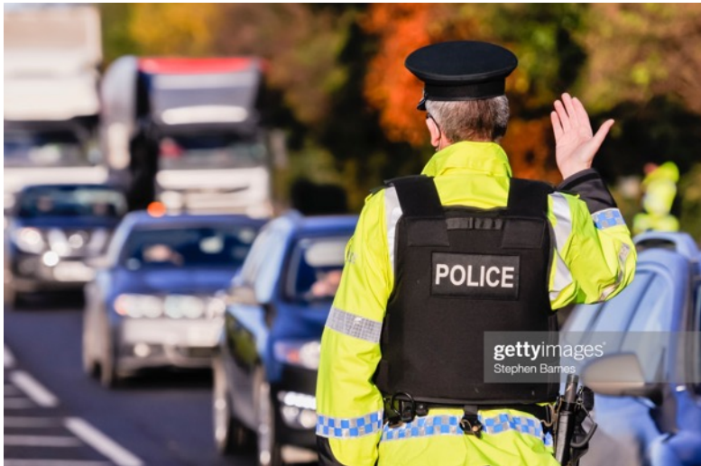
Enhanced Department Services and Staff Retention