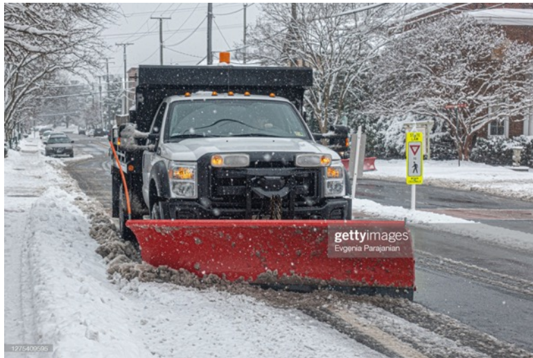
Snow and Ice Removal on Majority of Streets